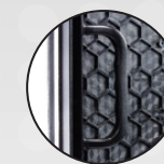
Ergonomic handle placement for easy handling during setup and teardown