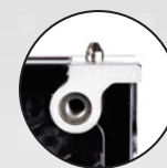
Diecast threading for easy mounting to any surface

*All specifications are property of PixelFLEX LLC., and are subject to change without notice. Please verify specifications and information before final sale.