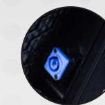
Reliable, industry standard connections