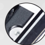
Alignment posts on all sides for easy alignment for a seamless installation