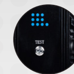
Accessible preview button for signal and power check