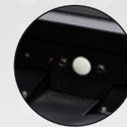
Preview test button with signal and power indicator LEDs