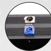
Reliable, industry standard, power and data connections.

*All specifications are property of PixelFLEX LLC., and are subject to change without notice. Please verify specifications and information before final sale. Specifications listed above are for the standard size, but are available in custom sizes. Please verify specifications at time of final purchase.