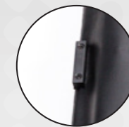
Magnetic alignment tabs for easy alignment of panels